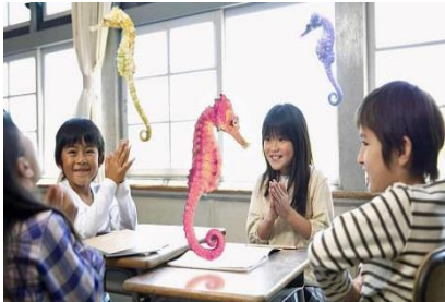
Display "free" 3D